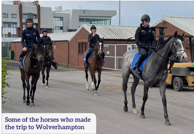
Some of the horses who made the trip to Wolverhampton

Of course, the Black Country venue has long been a happy