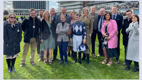
Club members in the paddock at Doncaster

MICHAEL Owen Racing Club members enjoyed an exciting start to the turf season with He's A Gentleman running in the valuable Lincoln consolation race at Doncaster.