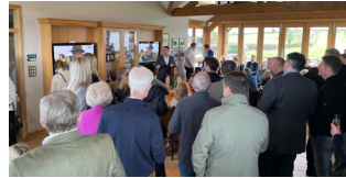
The God Cup day event at MHS

A tour of the yard and gallops was followed by a drinks