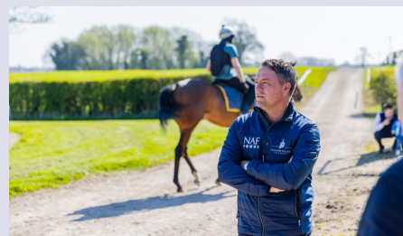
Club membership could be a great gift

If you're after a Christmas present with a difference then membership of the Michael Owen Racing Club could be just what you're looking for!