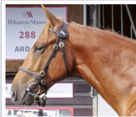
DUTCH ART x DIVINE HERALD

A son of Dutch Art, this chesnut colt's second dam, Heaven Sent, won six races and more than 300k in prize money. His sire was a top-class two-year-old, winning Group 1s in the Prix Morny and Middle Park, and has been a good source of sprinters and milers.