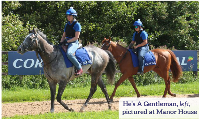
He's A Gentleman, left, pictured at Manor House

Carved in Stone provided MHS with its first-ever success under National Hunt rules when taking a Doncaster bumper on December 2 – see Page One.