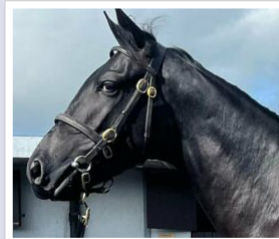
MOHAATHER x SHAAQAAF

An outstanding two-year-old, this striking colt's sire, Mohaather, was one of the favourites for the 2000 Guineas before injury intervened. However, he returned as a four-year-old to win the Group 1 Sussex Stakes - one of five career victories from just eight starts.