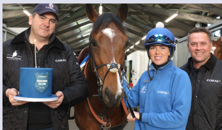
Celebrating Coral Racing Club's first birthday

MANOR House was delighted to join in last month's celebrations to mark the first birthday of Coral Racing Club.