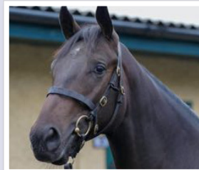
KODI BEAR x NATEEJA

This bay / brown colt is a son of Kodi Bear, sire of six stakes winners including the Group 2-winning juvenile Go Bears Go. His dam Nateeja, who won two races at three years, has produced two winners from three runners and five foals of racing age.