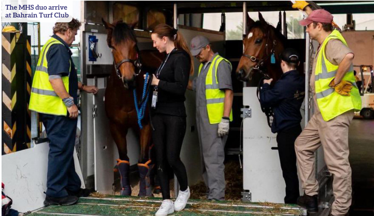
The MHS duo arrive at Bahrain Turf Club