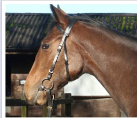
MEHMAS x NAFITHAA

This bay filly is by the high-class two-year-old Mehmas, who has been responsible for 49 black-type horses from just four crops. While none of his dam's progeny have yet raced, his second dam Lanansaak has produced three winners from five foals.