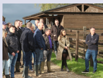
Empire Global visit

Empire Global Finance is a Chester-based firm of specialist indepen-