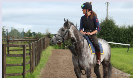
He's A Gentleman scored on his club debut

WITH He's A Gentleman scoring on his first start for the Michael Owen Racing Club, now could be an opportune time to sign up for a piece of the action.