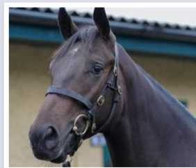
KODI BEAR x NATEEJA

This bay / brown colt is a son of Kodi Bear, sire of six stakes winners including the Group 2-winning juvenile Go Bears Go. His dam Nateeja, who won two races at three years, has produced two winners from three runners and five foals of racing age.