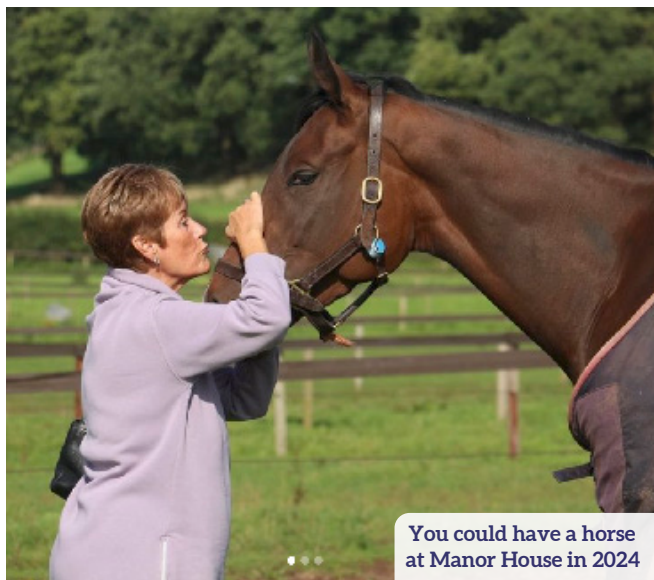
You could have a horse at Manor House in 2024

● Visit the Horses for Sale page on the MHS website, or call 01948 820485, if you would like to learn more.