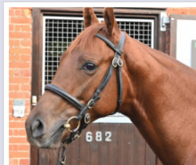
SOLDIER'S CALL x WINTER SNOW

A son of Soldier's Call, this chesnut colt is typical of his sire, a smart sprinter who is enjoying an outstanding first season at stud. Dam Winter Snow has produced two winners from three runners, while second dam Gonfilla won seven races and more than 600k.