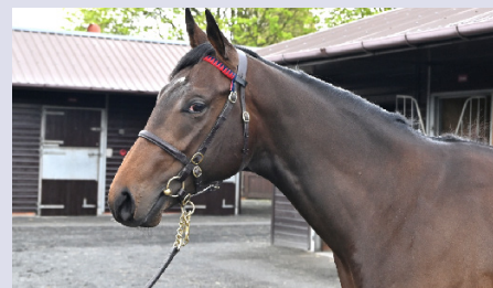
A son of the late, great Havana Gold

MHS has shares available in a well-regarded two-year-old son of Havana Gold.