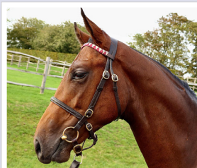
MEHMAS x HARRIET TUDMAN

Purchased at the Tattersalls Book 3 Yearling Sale 2023, this bay colt is by Mehmas, who was a high-class two-year-old and is the leading 3rd crop sire of black-type horses. His dam was a winner at three, while second dam Saoirse Abu won more than £300,000.