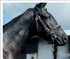
MOHAATHER x SHAAQAAF

An outstanding two-year-old, this striking colt's sire, Mohaather, was one of the favourites for the 2000 Guineas before injury intervened.