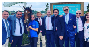
Box To Box's owners

Battling on bravely in the final stages, he came home three-quarters of a length to the good over second-favourite Jean Baptiste, with a further neck back to Bizarre Law in third.