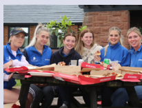
MHS team members