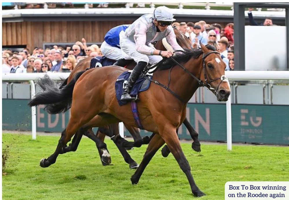
Box To Box winning on the Roodee again