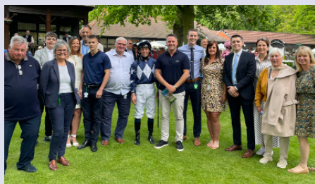
Racing club members at Haydock

THE revamped Michael Owen Racing Club remains open for new members.