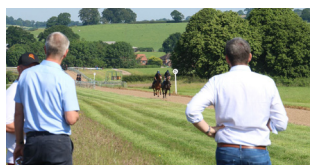
Roudee Racing visitors

Roudee Racing are looking forward to their as-yet-unraced