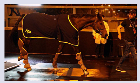
Flaming Rib on route to Hong King

FLAMING Rib came up short in his battle with some of the world's best sprinters in the £1.2M Chairman's Sprint at Sha Tin, in Hong Kong, on Sunday.