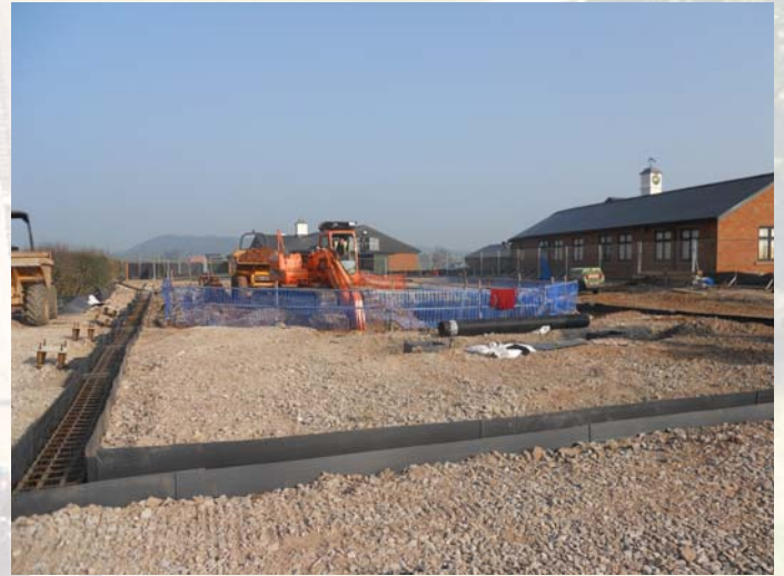
Week 7: foundations in and pool being dug out