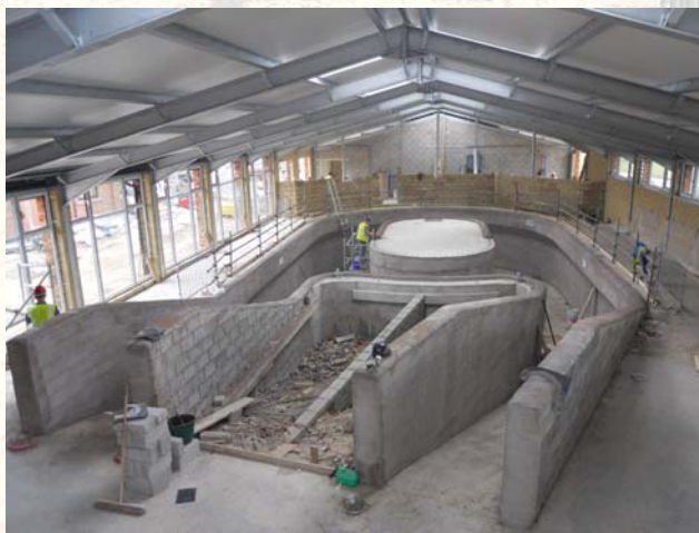
Week 26: Pool and ramp rendering are nearing completion while windows and lighting are fitted